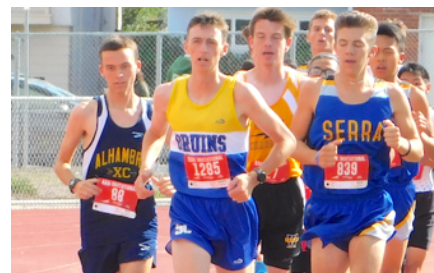
The top three finishers were already in the front of the race on the first lap.