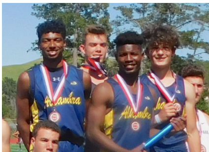
Proud boys on the podium.