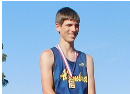
School Record !