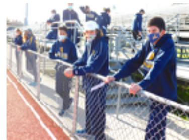
Alhambra displays some serious seriousness watching the early races.