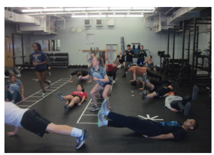
Squats, pushups, flutter kicks.