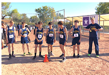
The BFS stands tall and menacing at the start.