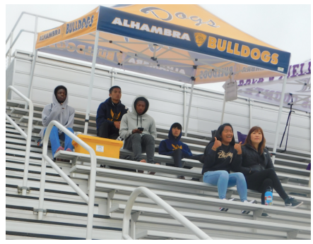
The early-bird field events show up before 8:00 a.m. They all have their game face on early.