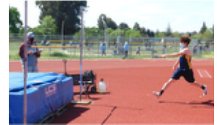
Cody strides into his penultimate step for the high jump.