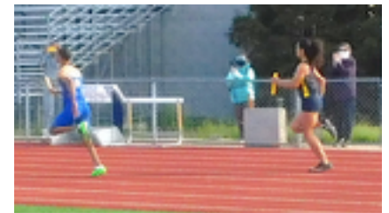
Desi is on anchor as the GV scares the Benicia boys. Good season opening time.