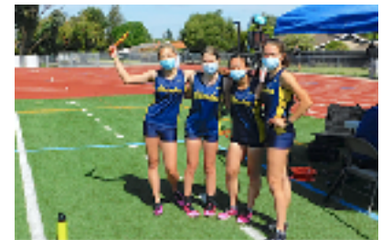
Everyone loves a baton, especially after winning the 4 x 400 relay.