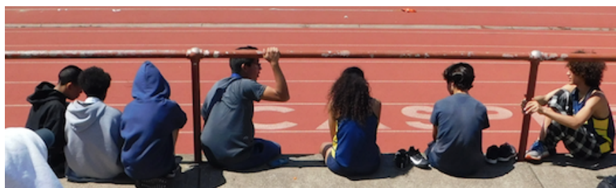
Our younger athletes crowd the rail to watch the action on the track.